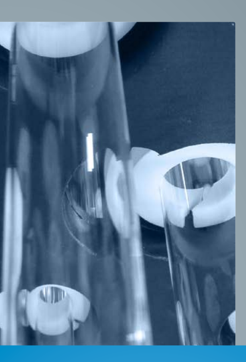
Automatic cleaning. Corrosion resistant materials.

Validated DVGW and Önorm UV sensor. Approved for dose control.